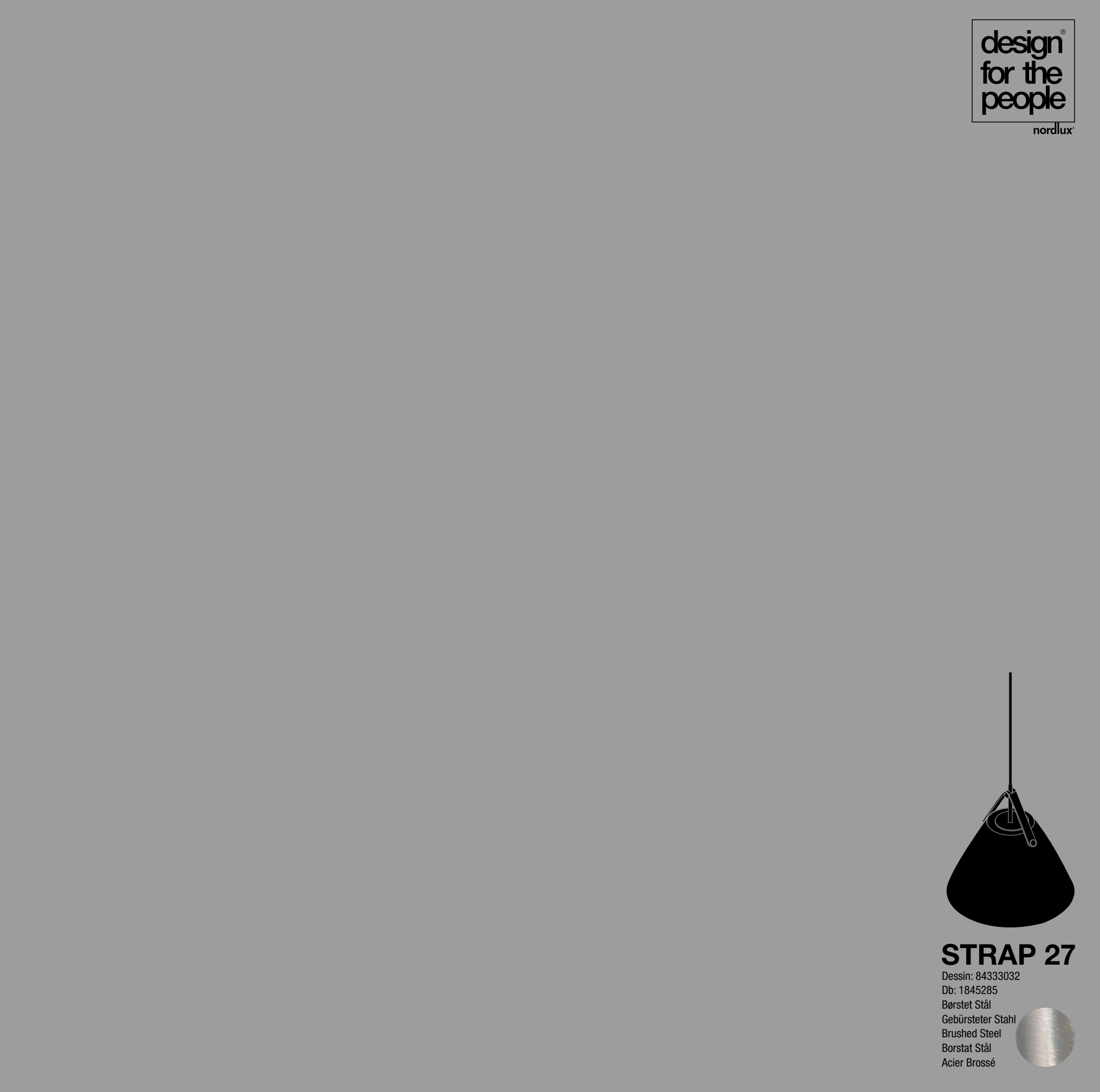
STRAP 27 Design: 84333032 Dk: 1843285 Brushed Steel Geflexstæbe: Stahl Borstet Stål Acier Brossé