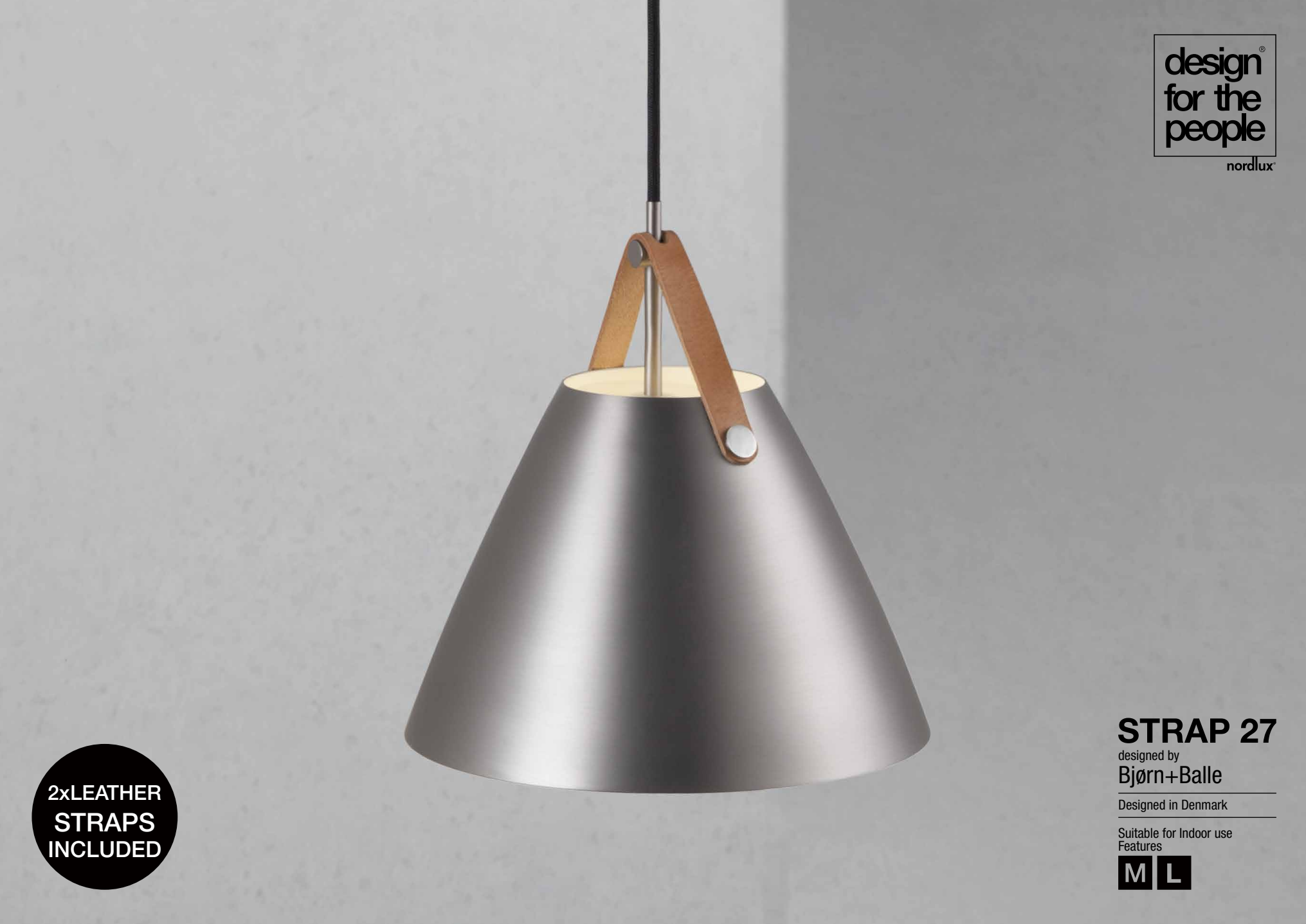
STRAP 27 designed by Bjorn+Balle Designed in Denmark Suitable for indoor use Features: M L