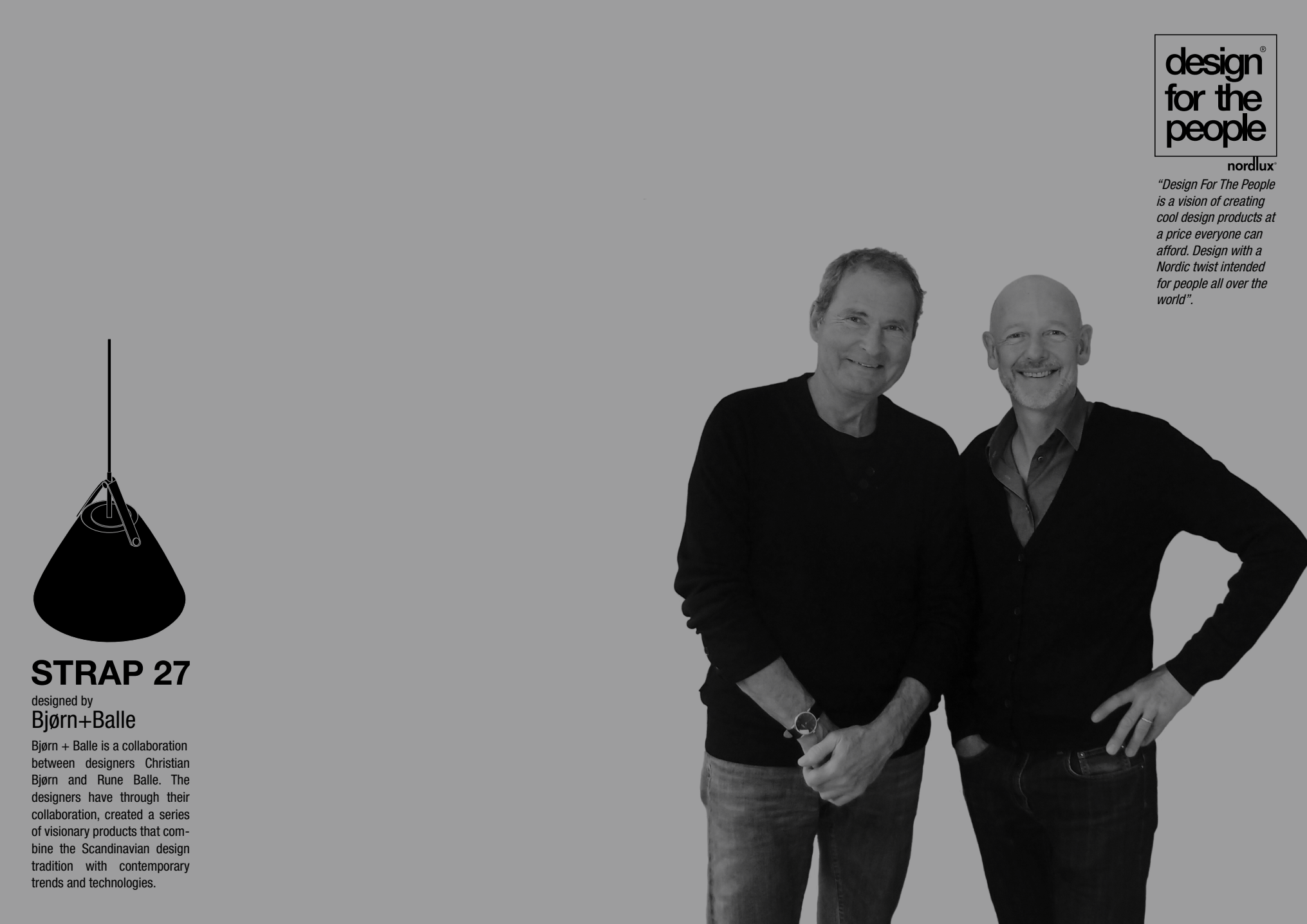
STRAP 27 designed by Bjorn+Balle Bjorn+Balle is a collaboration between designers Christian Bjorn and Rune Balle. The designers have through their collaboration, created a series of visionary products that com- bine the Scandinavian design tradition with contemporary trends and technologies.